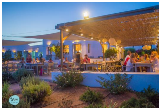
Value: £100 (£50 per dinner)

in the traditional Yorgis Taverna and in the relaxing YAM bar-restaurant